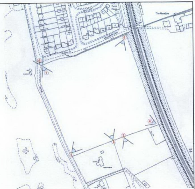
Location of internal viewpoints