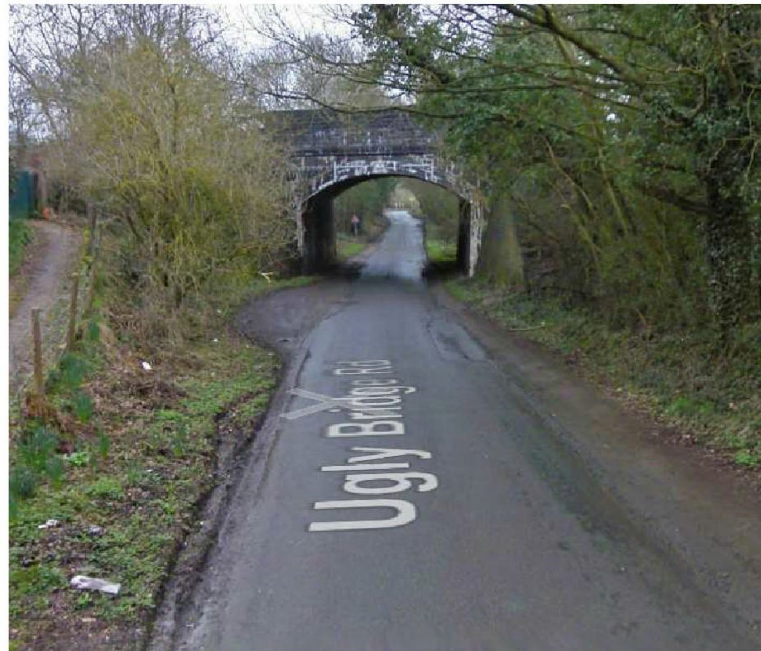
Ugly Bridge Road towards Birmingham Road