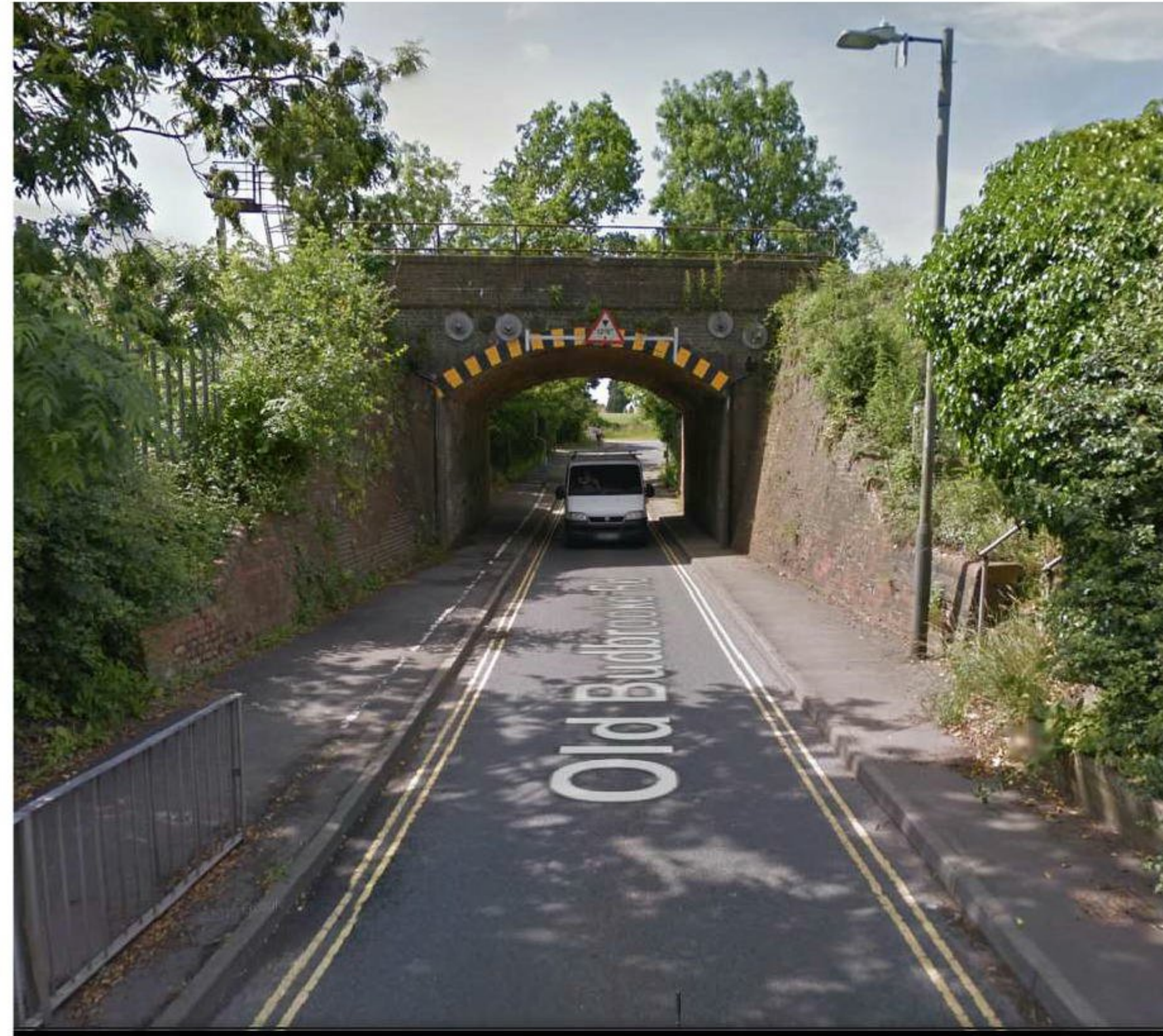
Old Budbrooke Road towards Hampton Magna