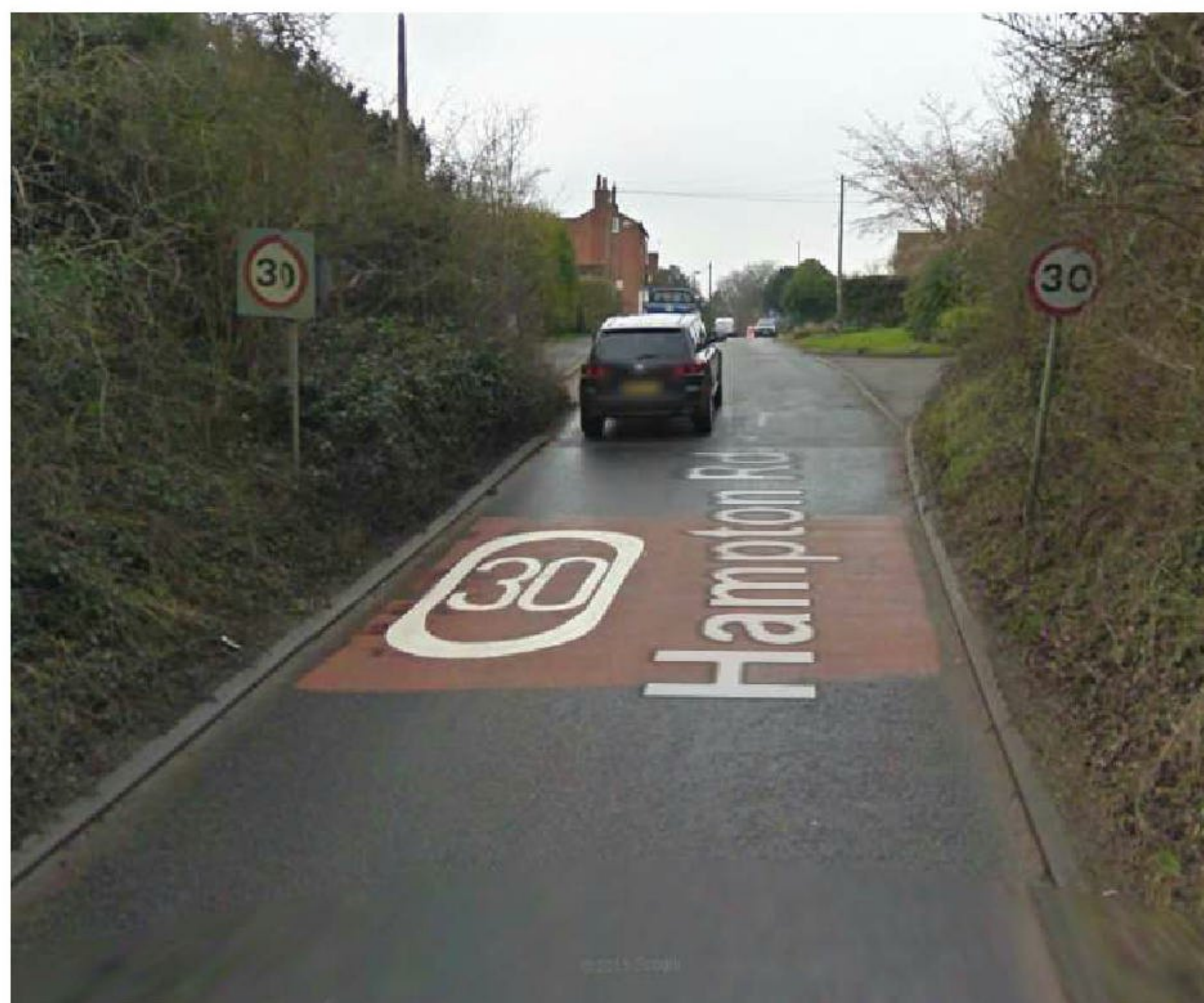
Hampton Road towards Hampton-on-the-Hill