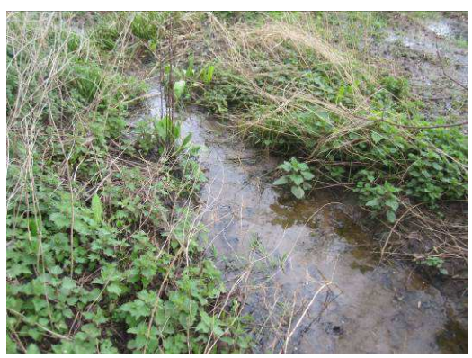
Wet ditch, south-east of site.

In addition, a short stretch of wet ditch runs along part of the southern boundary, leading into the Tach Brook. Species recorded along the ditch include broad-leaved dock Rumex obtusifolius , floating sweet-grass Glyceria fluitans , sedge sp and common nettle, with locally frequent reed canary-grass Phalaris arundinacea at the junction where the ditch meets the stream. The water level was very low within the ditch at the time of survey.