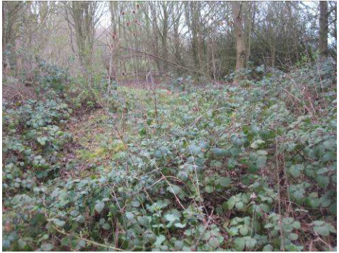
Scattered bramble scrub.

There are a few patches of bramble scrub within the woodland, mostly towards the west of the site.