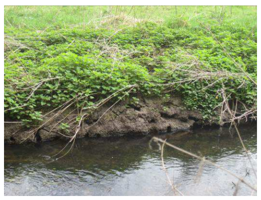
Examples of possible water vole burrows along eastern bank of brook.