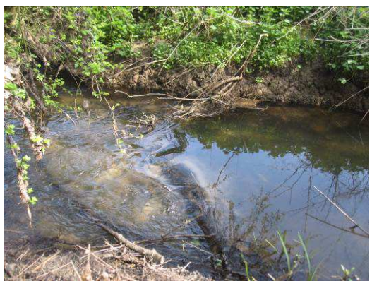
Typical section of stream.