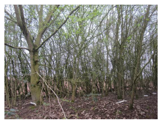
Linear hawthorn and blackthorn scrub, southern boundary.

Linear blackthorn and hawthorn scrub also runs along the western edge of Tach Brook, and includes within it occasional mature willow Salix sp. and ash trees. A short stretch of parallel dense blackthorn scrub exists along part of the brook towards the centre of the site, some of which has been cut down and stored as a line of brash at the base of the scrub vegetation.