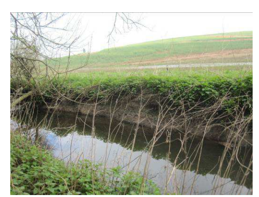
Sheer earth bank on Tach Brook with potential for kingfisher holes.

Birds exhibiting breeding behaviour (singing and alarm calls) during the site visit included chiffchaff Phylloscopus collybita , blue tit Parus caeruleus and great tit Parus major ; these are probably breeding nearby, but not necessarily on the site itself. In addition, skylarks Alauda arvensis were heard singing in the adjacent field to the east of the site and are likely to be breeding there. There is a barn owl Tyto alba record within 1 km of the site, but the site does not provide suitable nesting or foraging opportunities for this species; therefore it is considered to be absent from the site.