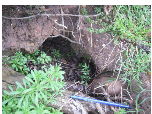
Active badger sett.