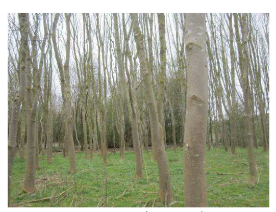
South-east compartment with more dense ground flora.

The woodland composition changes in the south-east part of the site. Here the canopy is dominated by ash and poplar and includes horse chestnut Aesculus hippocastanum . The understorey is dominated by blackthorn. Ground flora is dominated by poa sp. and wood avens, and also includes frequent hogweed Heracleum sphondylium , cow parsley Anthriscus sylvestris , white dead nettle and lesser celandine Ranunculus ficaria . Other species recorded here were occasional cowslip Primula veris and herb robert Geranium robertianum . There is a small marshy area in the south-east corner of the site, which is dominated by sedge Carex sp, dock sp,, common nettle and lesser celandine.