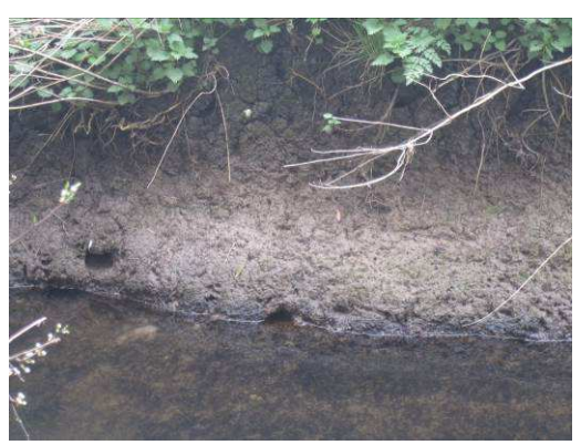
Possible crayfish burrows, one on left with 'flat' shape.

the presence of undermined, overhanging earth banks and a small riffle zone provide the potential for some crayfish refugia, which means the possibility of crayfish cannot be ruled out. A number of burrows were noted at the water's edge, one of which had the distinctive 'flat' shape of crayfish. However, there is a strong possibility that the burrow may have been created by a non-native crayfish species such as the signal crayfish, which are much better adapted to survive in sub-optimal habitat. There are no white-clawed crayfish records within 1 km of the site and no current white-clawed crayfish are known to exist within the surrounding area.