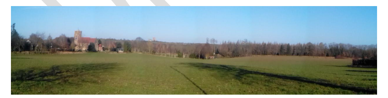
Open Views From Southam Road of the Church Setting Including Proposed Site 1

The English Heritage policy document "The Setting of Heritage Assets 2012" defines a setting as "the surroundings in which [the asset] is experienced." It goes on to say that "from the definition provided above, it can be understood that setting embraces all of the surroundings (land, sea, structures, features and skyline) from which the