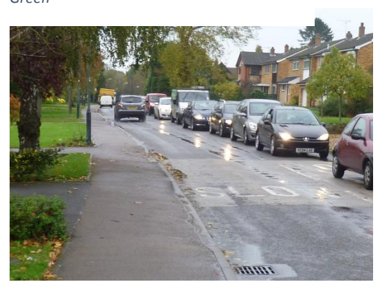
Looking up Offchurch Lane 100M from junction