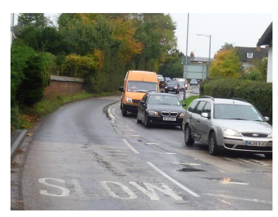
Looking East From Offchurch Lane on A425