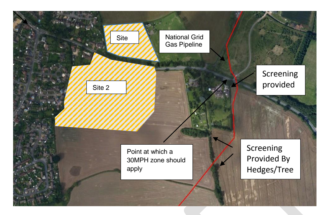
Aerial View Sites 2 & 3 1

Consequently, as the WDC environmental report is not representative of the parcels of land known as Sites 2, 3 and 4 it cannot be used as evidence to drive a preferred option. Further assessment is required although there is strong evidence that Site 2 and possibly 3 should be the preferred site over 1 on the basis of environmental visual amenity assessment.