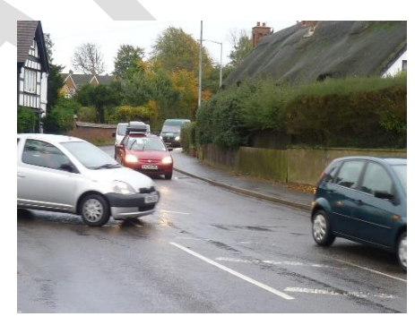
Offchurch Lane Junction