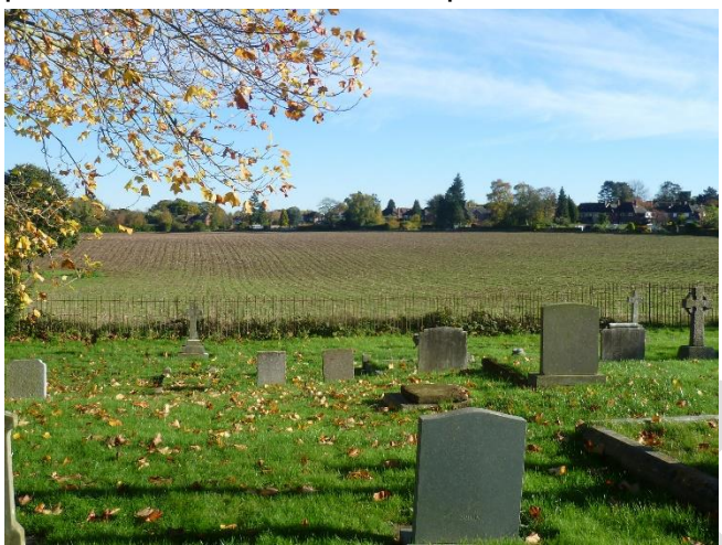
View from St Nicholas Church 1

heritage asset can be experienced or that can be experienced from or with the asset. Setting does not have a fixed boundary and cannot be definitively and permanently described as a spatially bounded area or as lying within a set distance of a heritage asset". The above picture was taken from Southam Road just opposite the White Lion Public House. Both St Nicholas Church, seen on the left hand side of the picture, and The White Lion pub are Grade II listed buildings. The area seen from